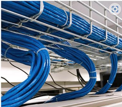
MCCORMICK & COMPANY - LEED V4.1

Our culture of sustainability runs through everything we do. Customers look to us for expertise on smarter, more efficient use of energy and resources—from solar solutions to lighting retrofits to indoor air quality.