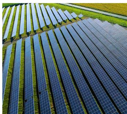
FREEMONT COMMUNITY SCHOOLS - SOLAR FARM