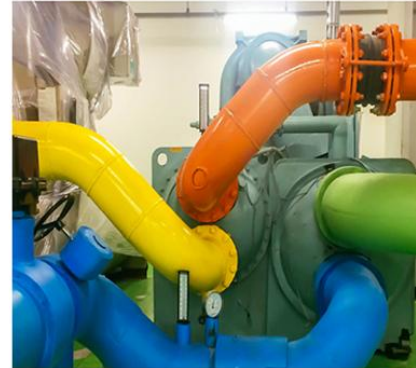
MOLINA HEALTHCARE - HVAC RETROFIT