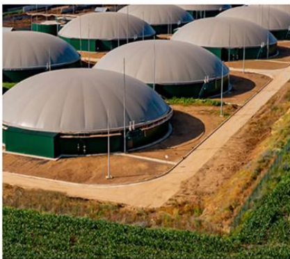
OAKRIDGE DAIRY - RENEWABLE BIOFUELS SYSTEM