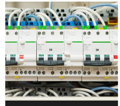
CONFIDENTIAL GLOBAL MANUFACTURER - CONTROLS RETROFIT