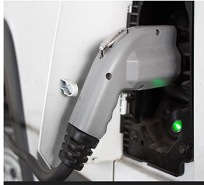
CONFIDENTIAL E-COMMERCE COMPANY - EV CHARGING