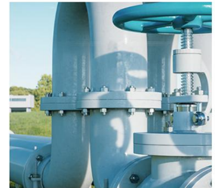
NUSTAR ENERGY - BIOFUELS DELIVERY