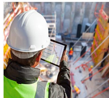
UNIVERSITY OF CALIFORNIA SAN DIEGO - LEED PLATINUM